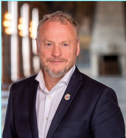
RAYMOND JOHANSEN, GOVERNING MAYOR, OSLO