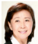
Minister Dr. Christina Y. Liu