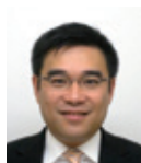
King Wai Lo