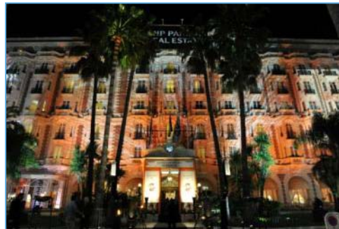
OPENING COCKTAIL PARTY