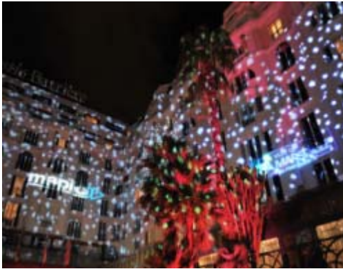
OPENING COCKTAIL Optioned for Italy, Country of Honour