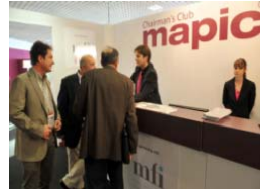
CLUBS from 12,000€ to 25,000€ (Press, Business Lounge & Chairman's)