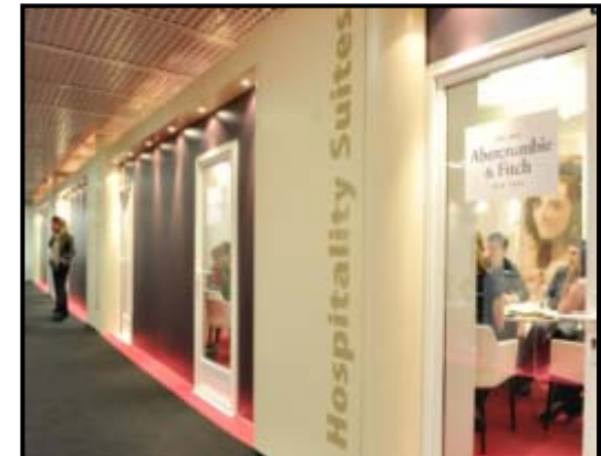
MEETING ROOMS from 1,120€ to 8,950€

CONSULT US FOR AVAILABILITY & FULL RANGE OF PRICES