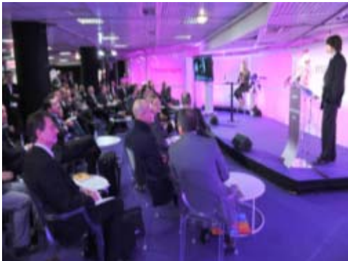
CONFERENCES from 5,000€ to 20,000€