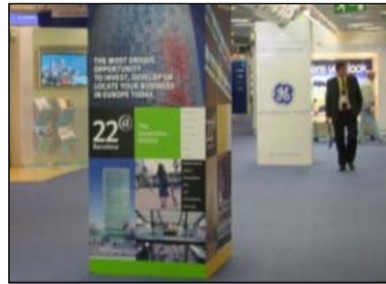
PILLARS from 2,680€ 1face to 10,780€ (+production costs non incl.)