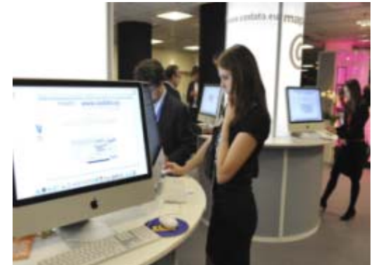
E-MAIL POINTS 6,200€

CONSULT US FOR AVAILABILITY & FULL RANGE OF PRICES