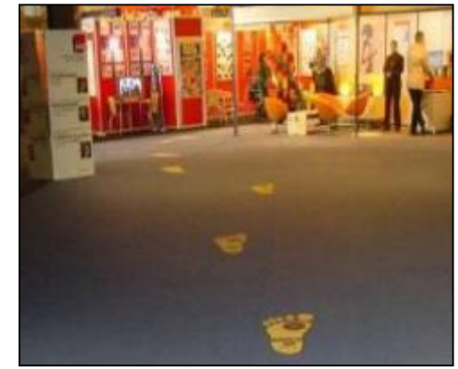
CARPET STICKERS 6180€ (+production costs non incl.)

CONSULT US FOR AVAILABILITY & FULL RANGE OF PRICES