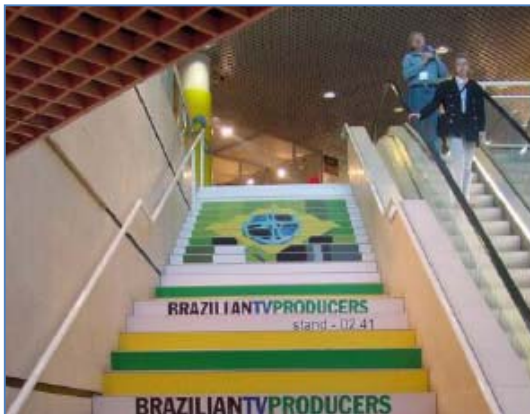
STAIRS 6,400€ (+production costs non incl.)