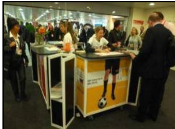
INFO DESKS 8,000€ per desk