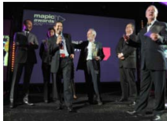
AWARDS CEREMONY from 20,000€