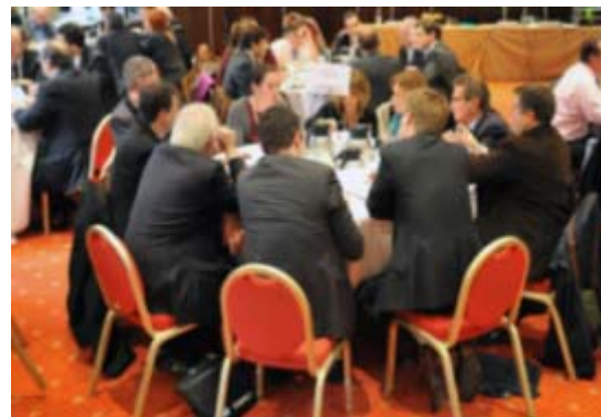
« RETAIL IN THE CITY » SUMMIT 15,000€