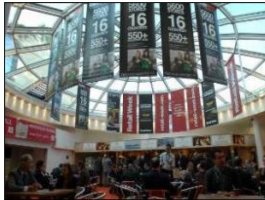
INSIDE BANNERS from 1,500€ to 15,000€ (+production costs non incl.)