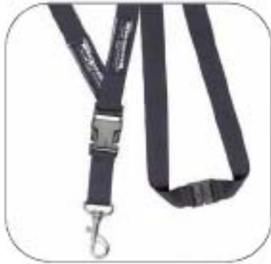
LANYARDS 15,000€ (+production costs non incl.)