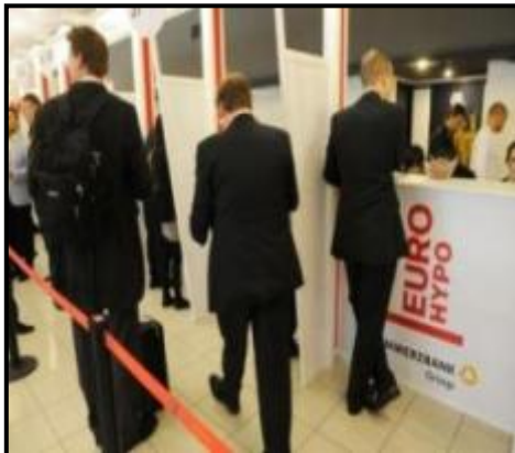
REGISTRATION AREA 15,000€