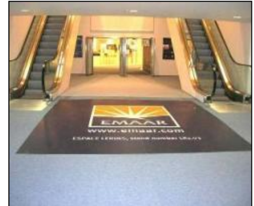
FLOOR CARPETS from 9,595€ to 11,530€ (+production costs non incl.)