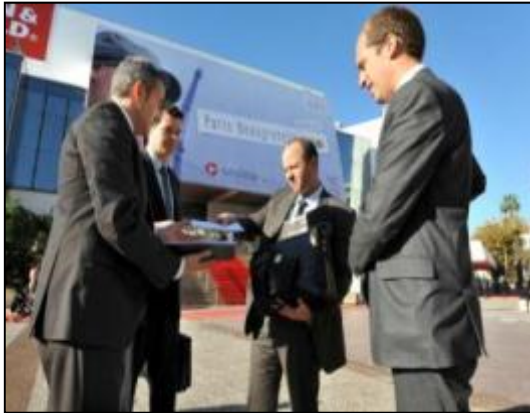
OUTSIDE BANNERS from 3,000€ to 40,000€ (+production costs non incl.)