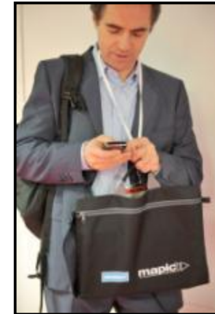
DELEGATES BAGS 25,000€ (+production costs non incl.)